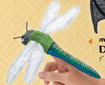
mini Dragonfly 7" long 8011