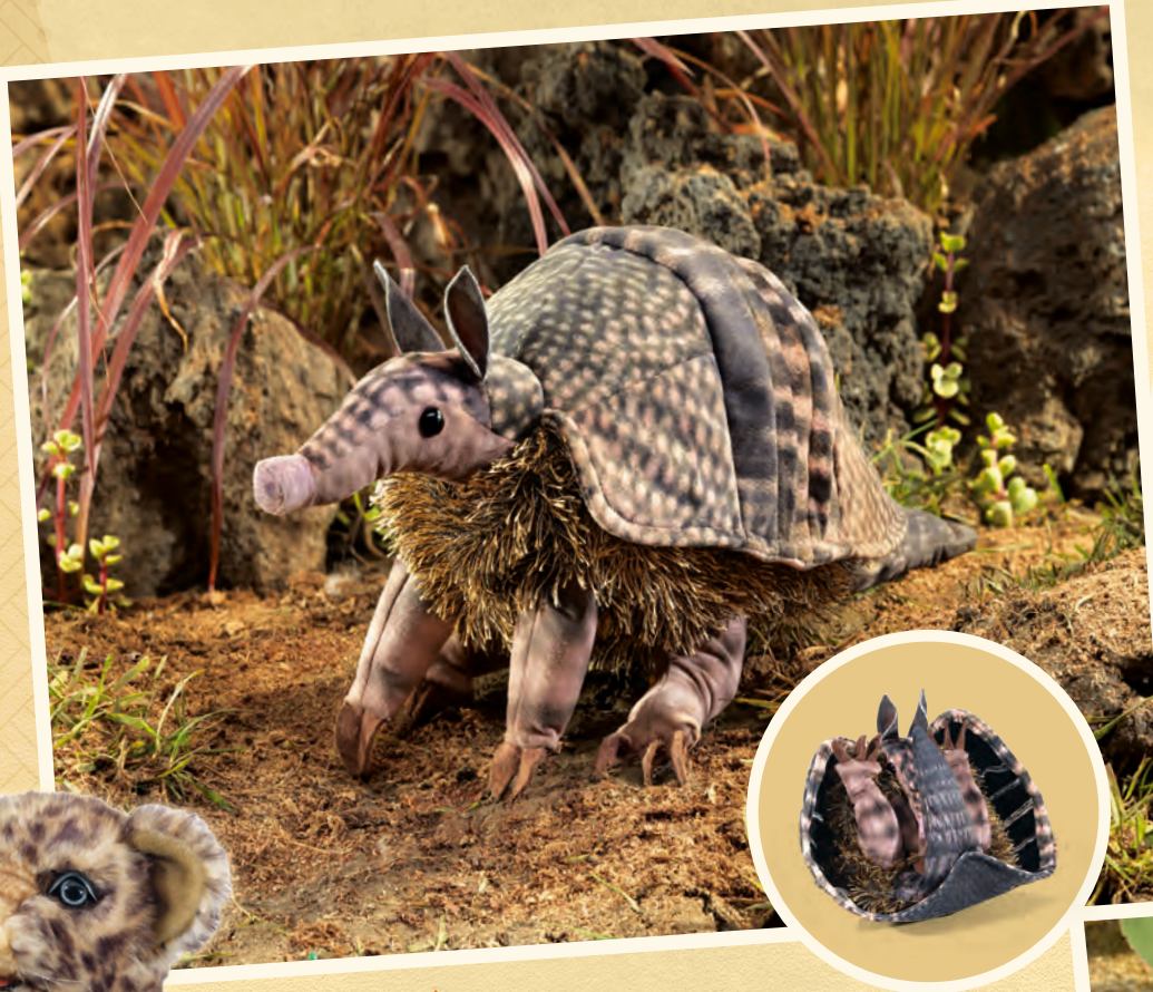
Armadillo 17" long 3207 Rolls and secures with magnets.