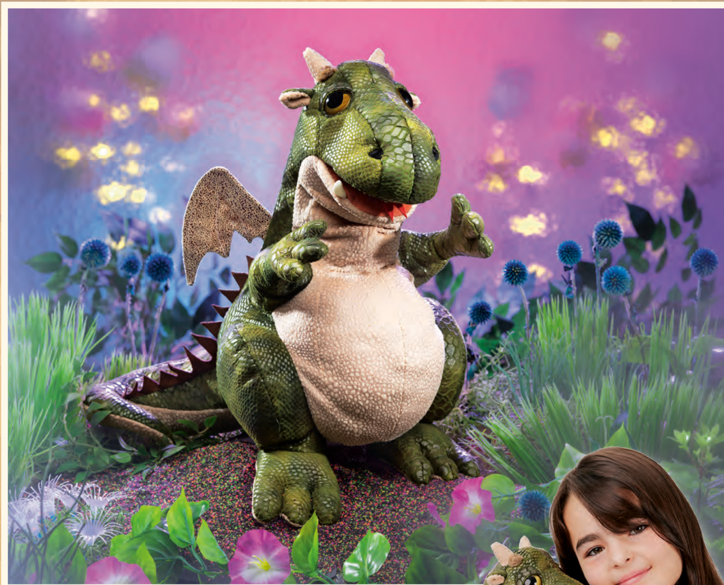
▲ Friendly Dragon 16" Tall 3211